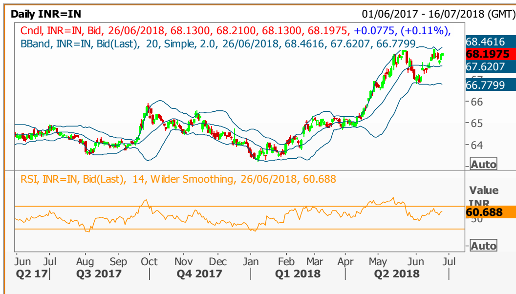
Major Currency Chart