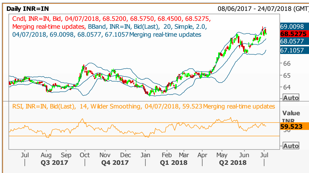
Major Currency Chart