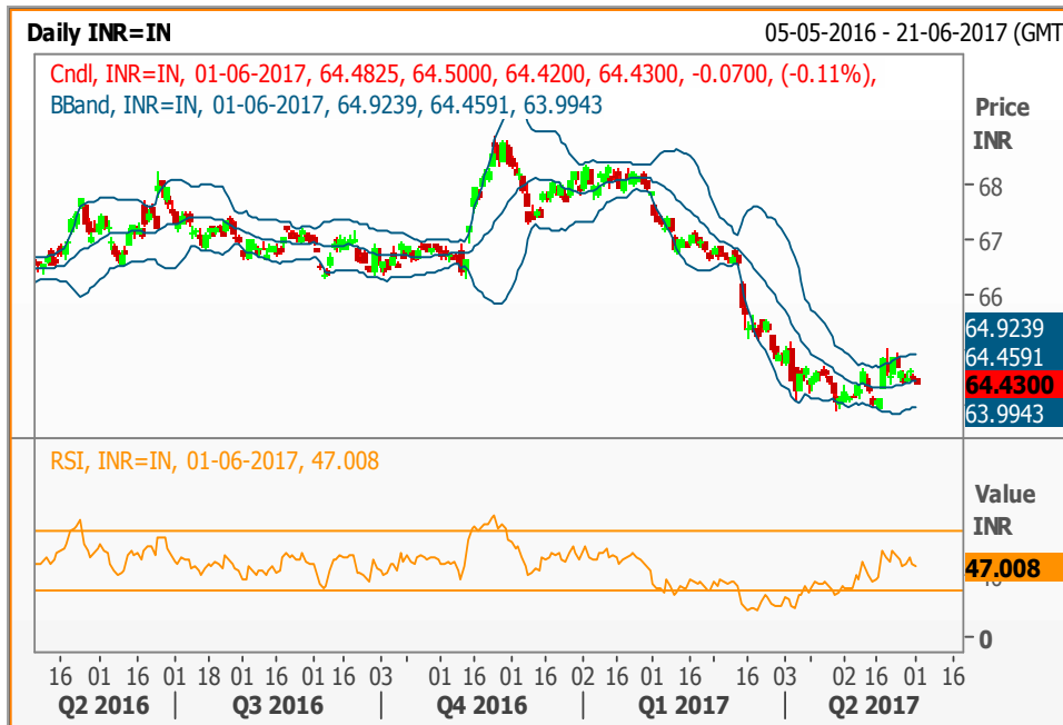
Major Currency Chart