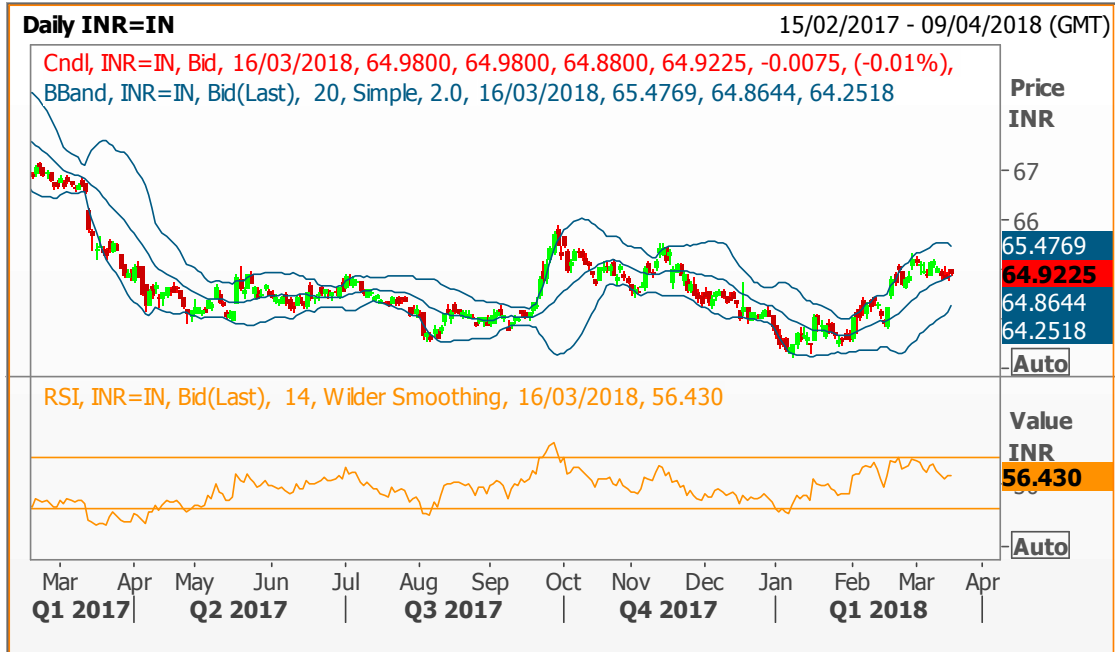
Major Currency Chart