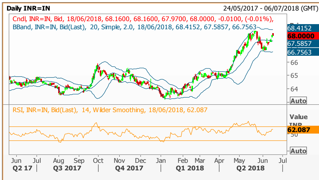
Major Currency Chart