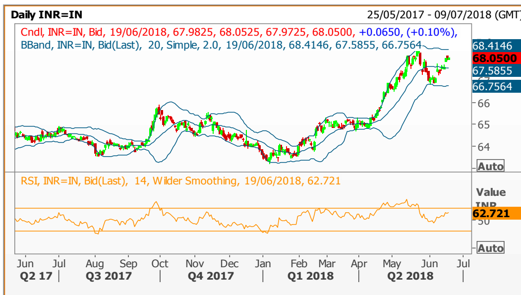
Major Currency Chart