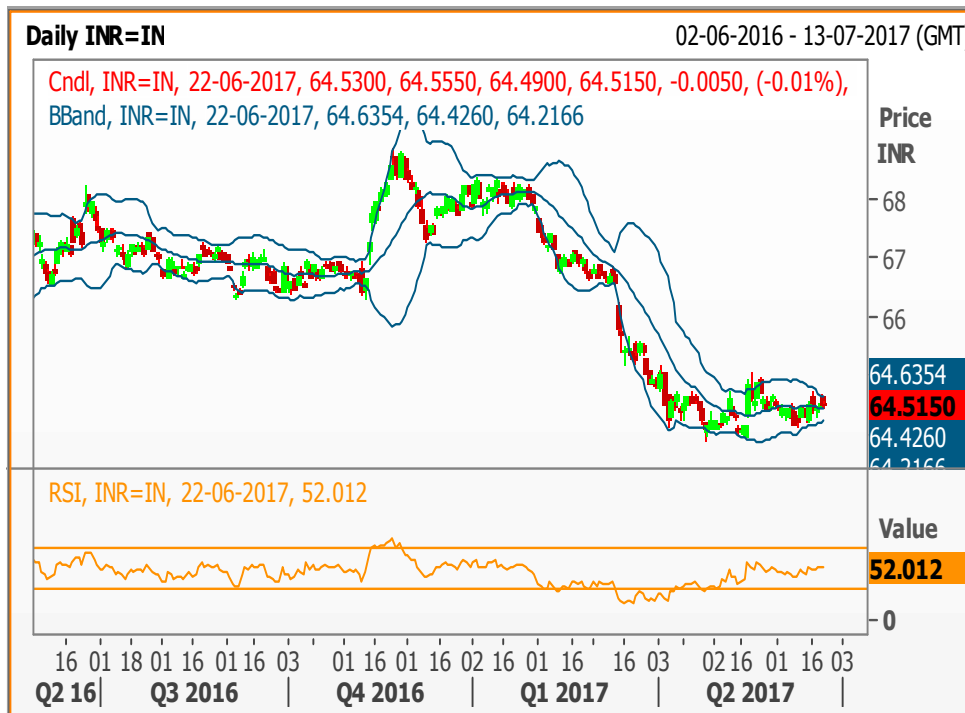
Major Currency Chart