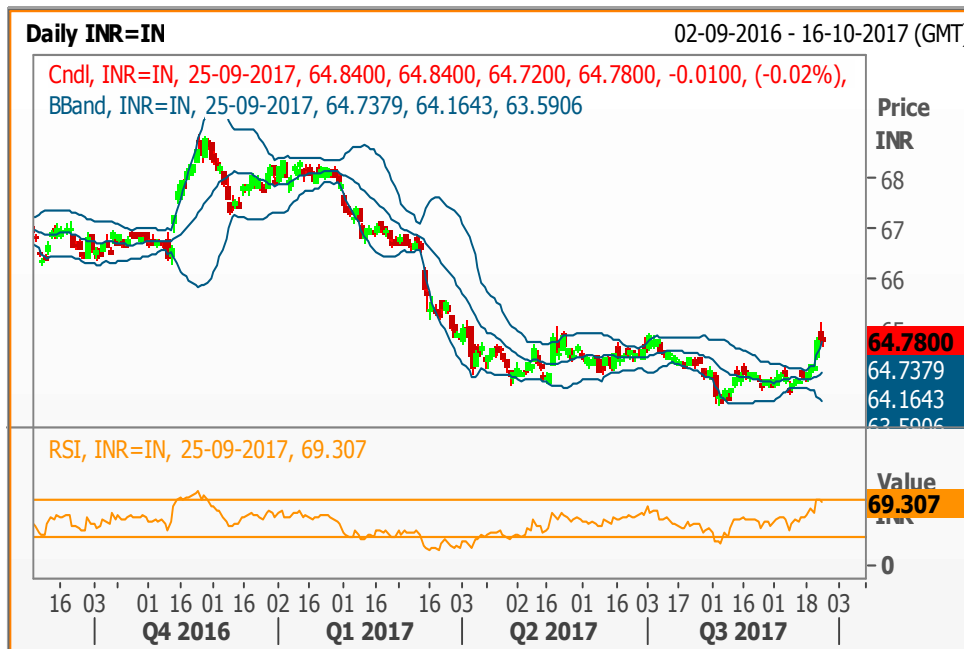
Major Currency Chart